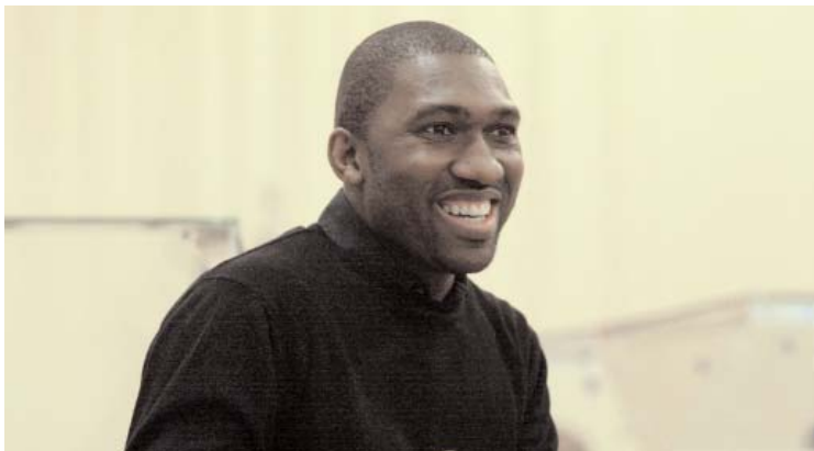
Kwame Kwei-Armah

The only true elevator in society is education. The only way to access that is through self-motivation. I was a 'B' grade student at school and didn't perceive myself in academic terms. My motivation for self-education as a man was political, personal and social, and I think we all have an obligation to fulfil our potential and not leave it to waste.