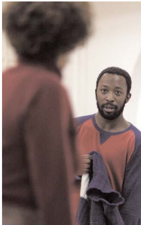
Shaun Parkes