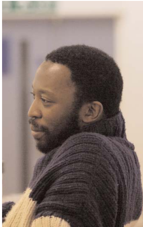
Shaun Parkes

As AD, it's my job to organise and oversee the understudy casting process, so today, I email the casting 'breakdown' (requirements) to lots of agents so they can offer suggestions for the understudy actors who will join us in Birmingham.