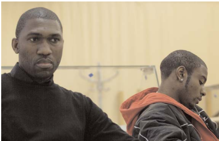
Kwame Kwei Armah and Michael Obiora