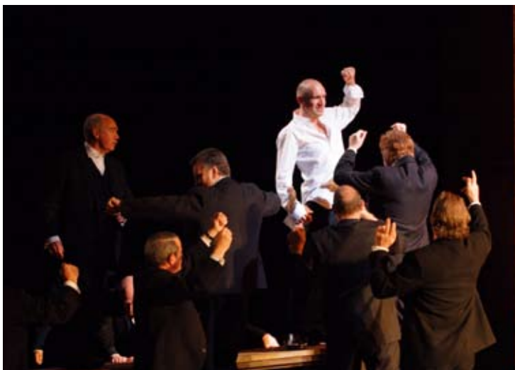
Photo (Ralph Fiennes with members of the Chorus) by Catherine Ashmore